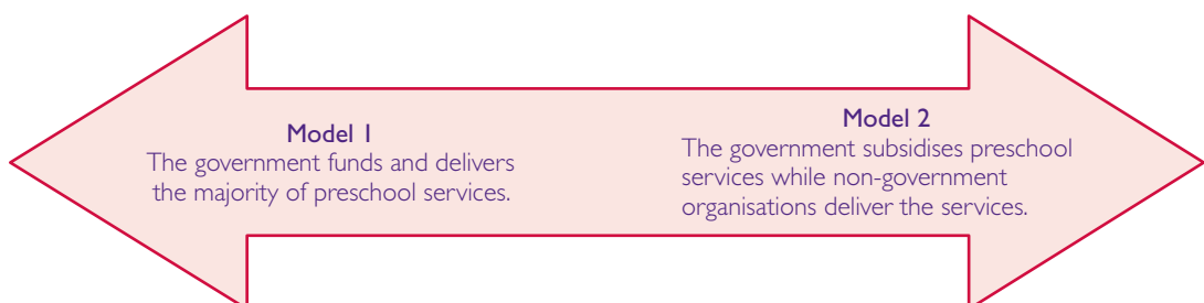
Figure 2: Two models for describing preschools in Australia

No jurisdiction entirely fits the 'government' or 'non-government' model (even Western Australia has a number of non-government schools-based preschools that receive subsidies from the state government). Jurisdictions are a mix of the two models and the reality is more complex than these models suggest. For example, in New South Wales, the government delivers some preschool education (in government schools) subsidises some preschool education (community preschools) but neither subsidises nor delivers preschool services