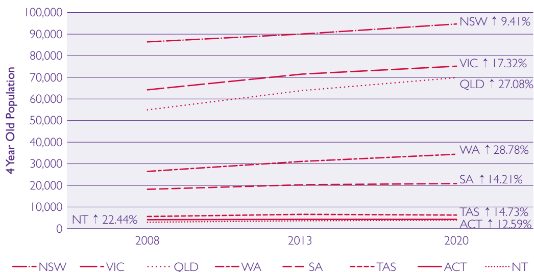
Figure 3: Resident 4 Year Old Population Projections: 2008; 2013; 2020