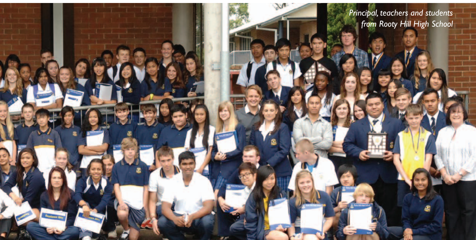
Principal, teachers and students from Rooty Hill High School

If you have expertise in proposal writing, share your skills and knowledge with others to build individual and organisational capacity.