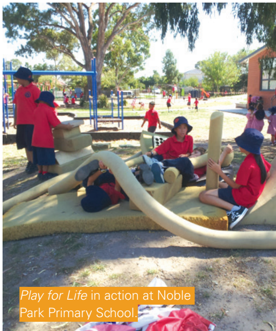
Play for Life in action at Noble Park Primary School.

Play for Life was established to promote and encourage placing a greater value on the importance and benefits of play for children. As outlined in the United Nations Convention on the Rights of a Child (UNCRC) in Article 31, all children have the right to play. Every child fosters a natural desire to play. It is considered by children to be the most important thing they do each day and therefore critical to the promotion of their holistic development and wellbeing. Play often surpasses any societal barriers such as age, ability, gender, race, religion and social standing, so therefore can be inclusive to all children. Overall then, play is critical to children's physical, social and emotional development and is central to a healthy child's life. To learn more, visit: http://www.playforlife.org.au/