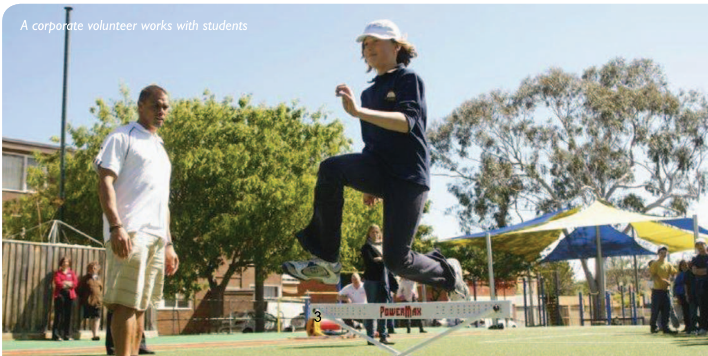
A corporate volunteer works with students

It may not always be easy to see how you might ‘measure’ impact, but use what data you have and explore opportunities to develop simple tools to capture the information you need.