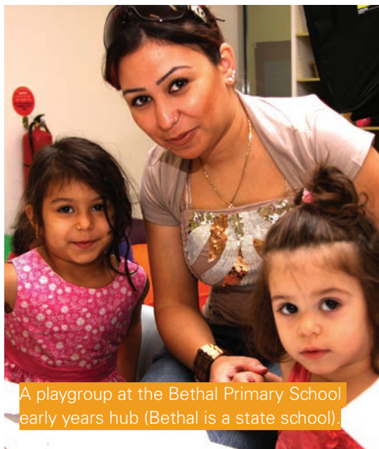
A playgroup at the Bethal Primary School early years hub (Bethal is a state school).

Supporting Parents – Developing Children ( SPDC ) was initiated in 2007 with the Scanlon Foundation offering to commit $1 million dollars to improve social cohesion in the City of Hume. The Federal Government seized upon the opportunity to seek a whole of government approach to the delivery of services in this Local Government Area (LGA). The outcome is that all levels of government, from local council to state, to Australian government departments provide support for the project. The City of Hume CEO organised a number of community round table forums around an existing common area of focus: Early Childhood Development. To learn more, visit: http://scanlonfoundation.org.au or http://www.hume.vic.gov.au